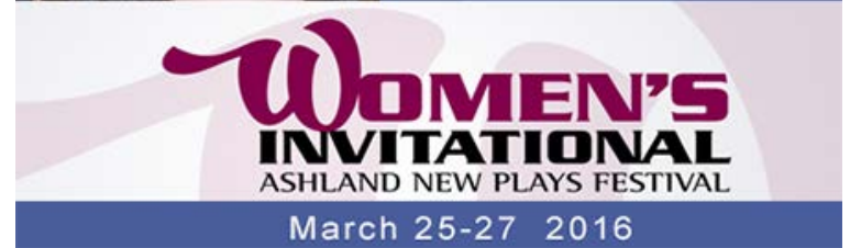
Digital Ad Cards with Winning Playwrights and Titles