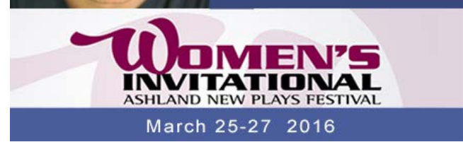
Digital Ad Cards with Cast Members