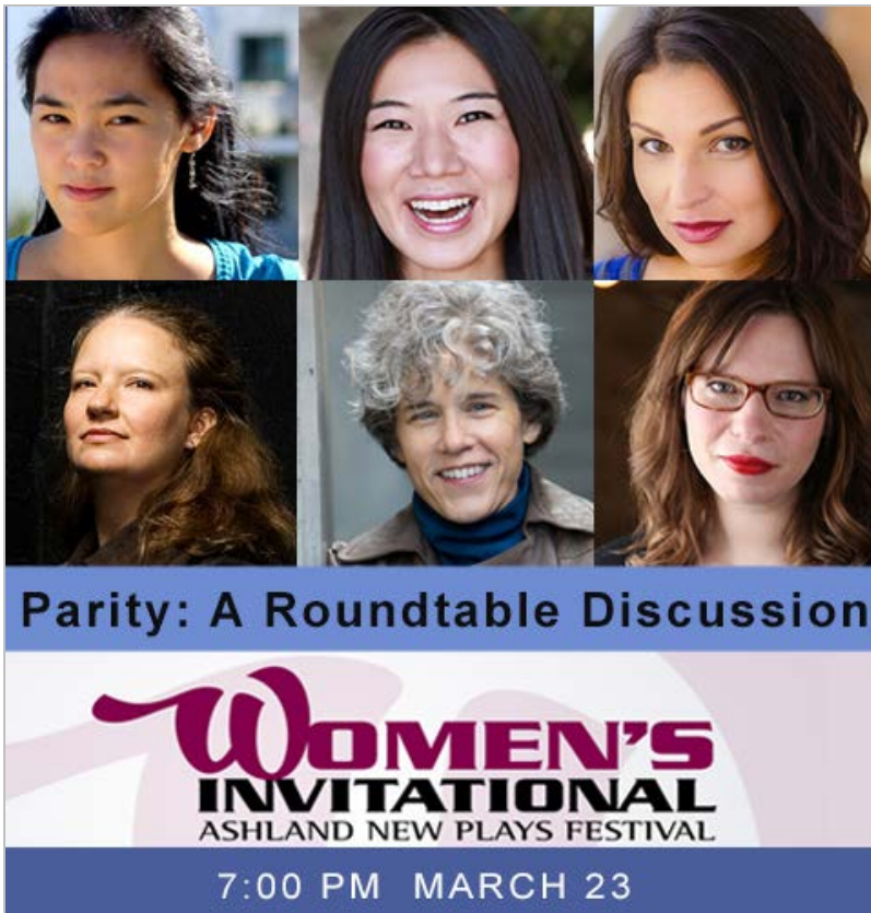
Digital ad for the Roundtable Discussion event used on Twitter and Facebook.